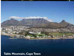
Table Mountain, Cape Town