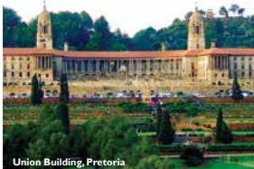
Union Building, Pretoria