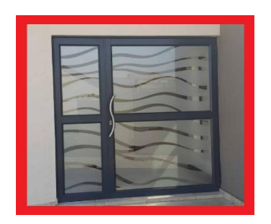
Note 3: Examples of Frosted Vinyl

Note 2: Bidders may offer more covered parking bays than required, BUT, same must be priced at rate of an uncovered bay. Parking bays in excess of the required bays as indicated on page 1 will not be paid for by the Department.