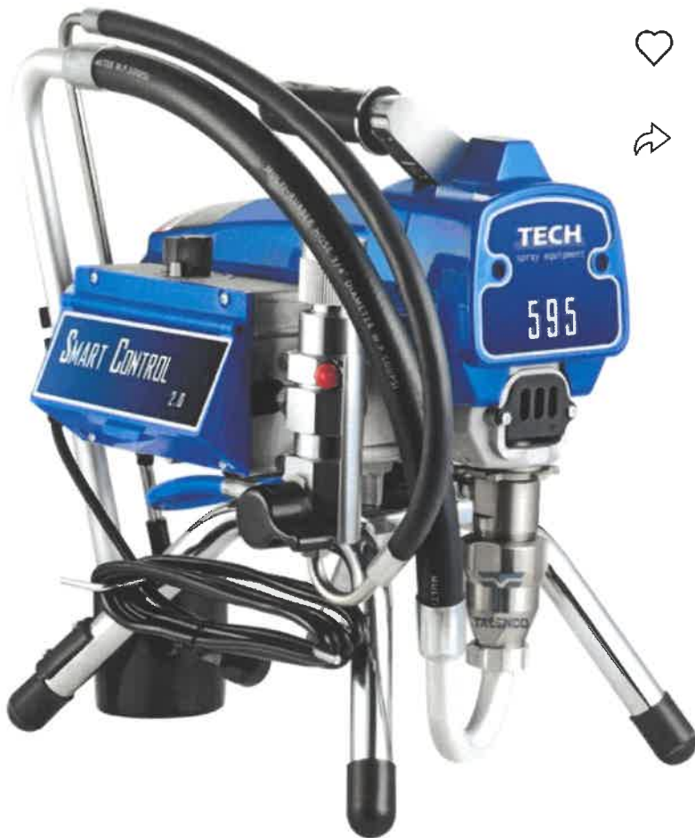
TECH ST-595 AIRLESS SPRAYER